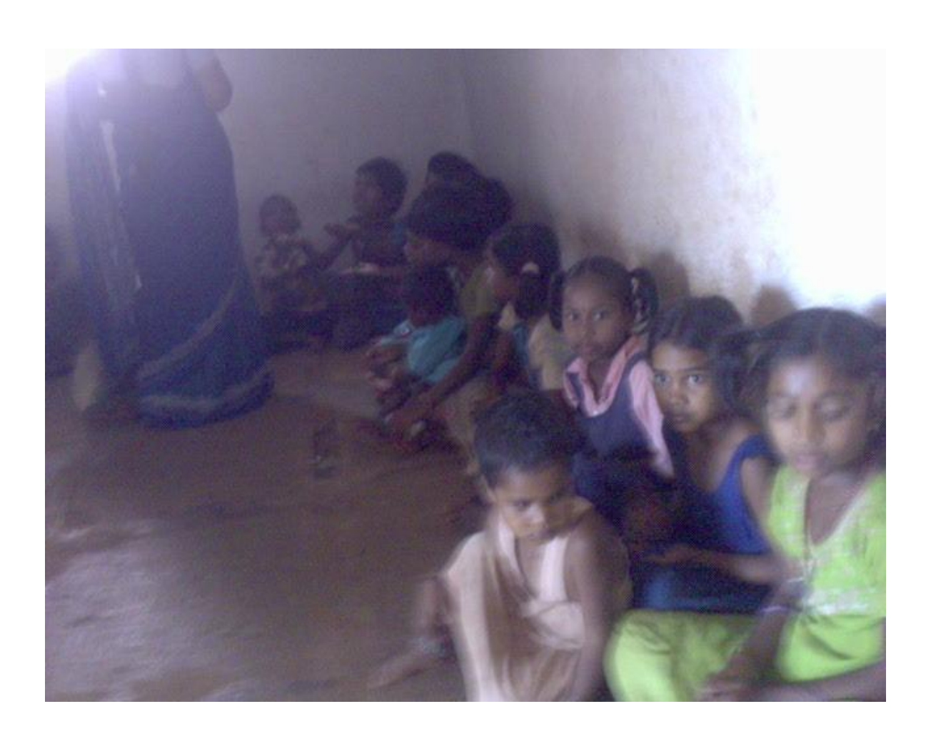
An Anganwadi situated in the Nawab Pet Mandal

Growth Monitoring and nutrition surveillance are two important activities that are undertaken. Children below the age of three years are weighed once a month and children 3-6 years of age are weighed every quarter. Children are weighed on a graded scale ranking from A-D wherein a represents balanced normal growth of a child and D represents malnourishment. Special attention is given to the children who belong to the D category by providing them with double ration in a day. Also a lot of emphasis is laid on the counseling the parents of such children so as to ensure that they are given adequate and timely meal at home as well. However if the child's weight does not increase even after such kind of